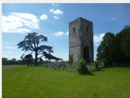
The remains of the church tower at Fornham St. Genevieve near where the battle was fought.

East Anglia Region Study Day Sunday 15th October 2023